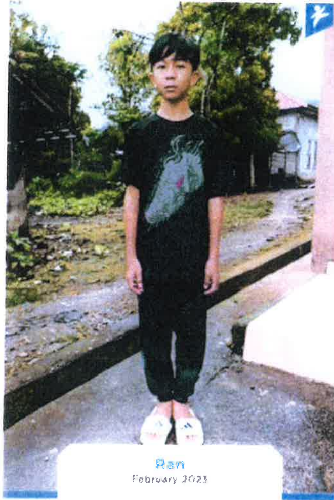
Ran February 2023

January 13, 2023. Shalom, hello friends. How are you? I hope you and your family are doing well and always under protections of the Lord. I wish you Merry Christmas and Happy New Year. I hope this year we will pleased God more. How as your Christmas and New Year holidays? I hope it was fun, I had fun holidays and celebrated Christmas and New Year happily. I also met my friends and relatives. I was grateful to celebrate Christmas and New Year with my family. Now I am back to learn at school and school holiday was over.