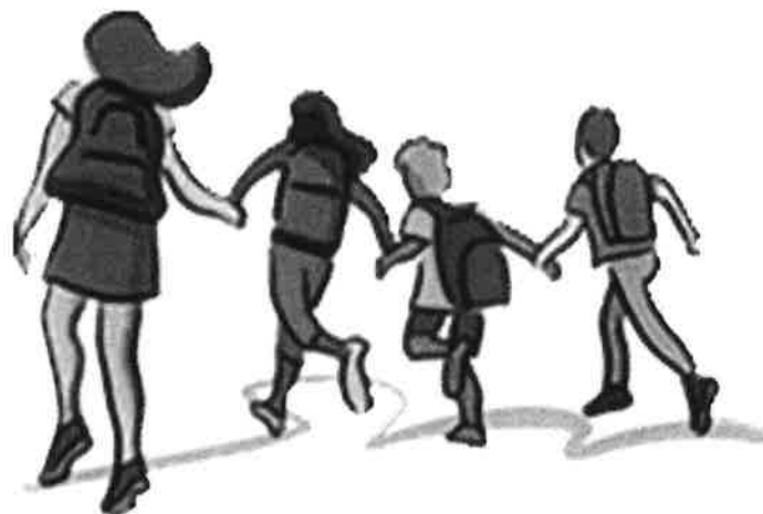
Pray for Our Students

16th Sunday after Pentecost September 25, 2022 First Reading - Amos 6:1-7 Psalm - Psalm 146:1-10 Second Reading - 1 Timothy 3:1-13 Gospel - Luke 16:19-31