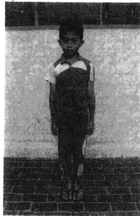
Ran 11 years old