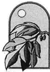
THE PARABLE OF THE FRUITLESS FIG TREE (Luk. 13:6-9)

6 Then he told this parable: 'A man had a fig tree planted in his vineyard; and he came looking for fruit on it and found none. 7 So he said to the gardener, "See here! For three years I have come looking for fruit on this fig tree, and still I find none. Cut it down! Why should it be wasting the soil?" 8 He replied, "Sir, let it alone for one more year, until I dig round it and put manure on it. 9 If it bears fruit next year, well and good; but if not, you can cut it down.''